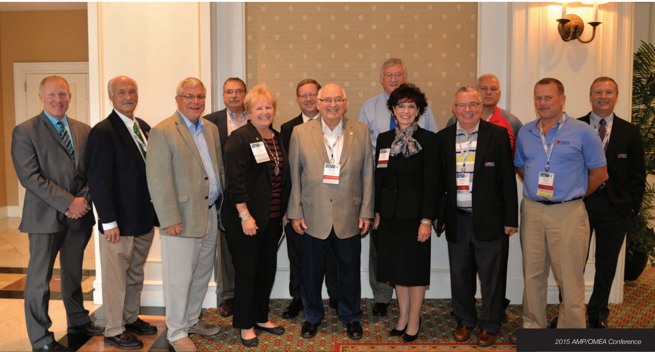
2015 AMP/OMEA Conference

The Ohio Municipal Electric Association (OMEA) is working to secure a better future for municipal electric systems across Ohio.