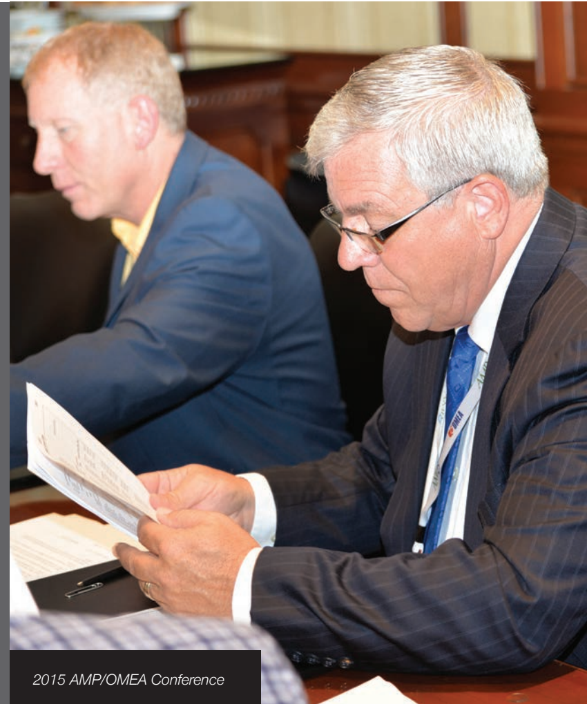
2015 AMP/OMEA Conference