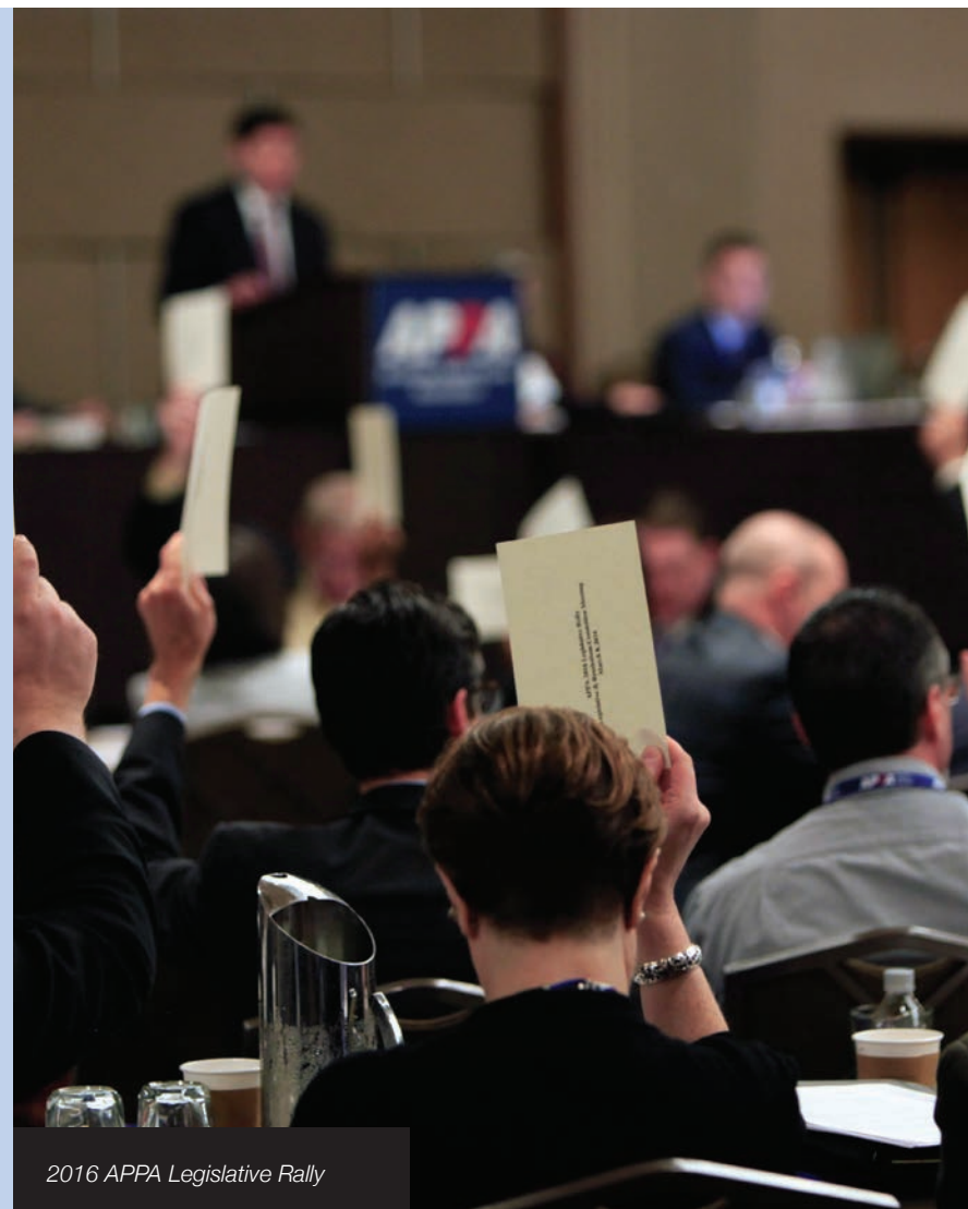
2016 APPA Legislative Rally

Environmental rules on the energy sector continue to dominate the debate over how to sustain and grow our economy through what will be an industry-wide transformation. The U.S. Environmental Protection Agency's (USEPA) rule – the Clean Power Plan – limiting power plant carbon emissions was stayed by the U.S. Supreme Court. However, the USEPA continues to move forward with critical elements of the rule while congressional Republicans push to block further agency action. A variety of USEPA regulations – covering air emissions, ash disposal and toxics substances – also continue to face congressional scrutiny and pushback.