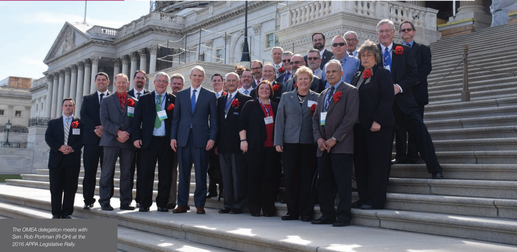
The OMEA delegation meets with Sen. Rob Portman (R-OH) at the 2016 APPA Legislative Rally.

OMEA played an important role in support of needed reforms of the federal hydropower licensing process in 2015. As a result of our efforts and those of our allies, the energy bills passed by both the House and Senate make critical changes that should shorten the license application and approval process, provide greater certainty, and reduce redundant studies and requirements. In the Senate energy bill debate, the hydropower licensing experience of AMP was repeatedly cited by Sen. Rob Portman (R-OH) as evidence of the need for licensing reform.